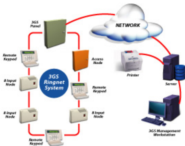
Typical Single Site (6401) Architecture